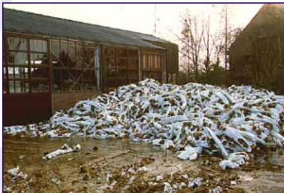
Previously used Grodan stone wool from commercial greenhouse to be recycled into new Grodan stone wool

Grodan stone wool is essentially rock-fibers. The beauty of rock is that it can be melted and spun back into fibers repeatedly and still achieve the same high-quality fiber at the end of the process. The high temperature that is used to melt the rock or used Grodan also completely sterilizes the product and removes all organic matter thoroughly each time.